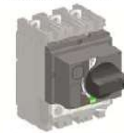
Standard operating handle