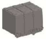
Extended terminal cover