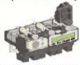
Trip unit with display