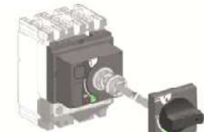
Extended rotary handle