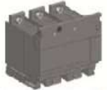
Current transformer block